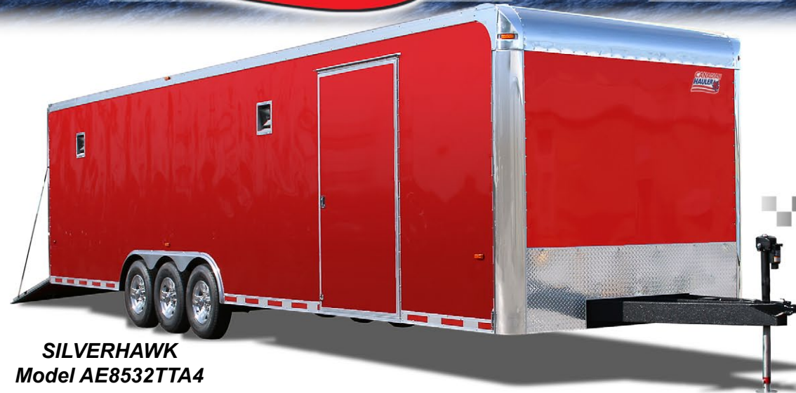
SILVERHAWK Model AE8532TTA4