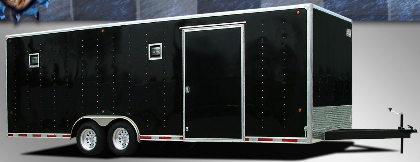
Model CHT8524TA3 (Shown with optional quartz lights)