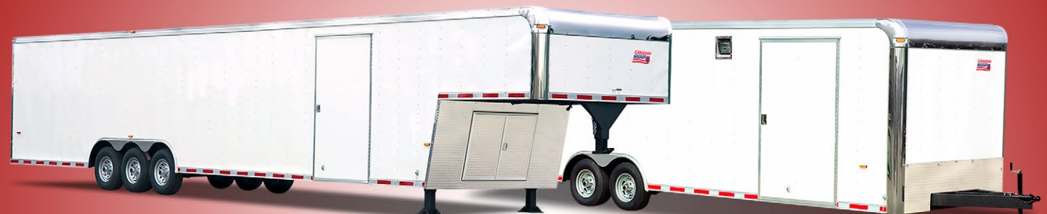
GOOSENECK Model AEG8544TTA3