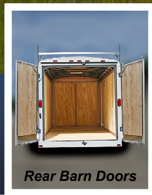
Rear Barn Doors