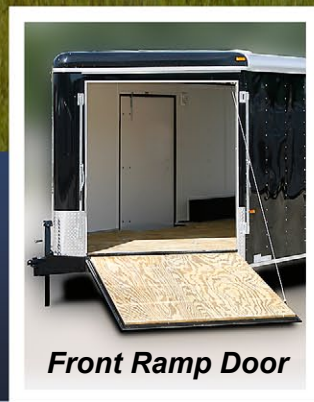
Front Ramp Door